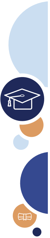
Graduation data for Louisiana from the National Center for Education Statistics IPEDS.